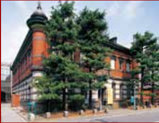
▲Akarenga Local history museum